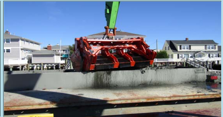
4 Loading a scow with dredge material