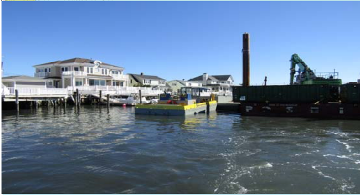
1 Pushing the dredge into position to remove material