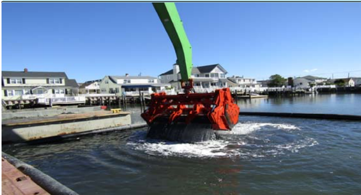
3 Removing material within the silt curtain moon pool