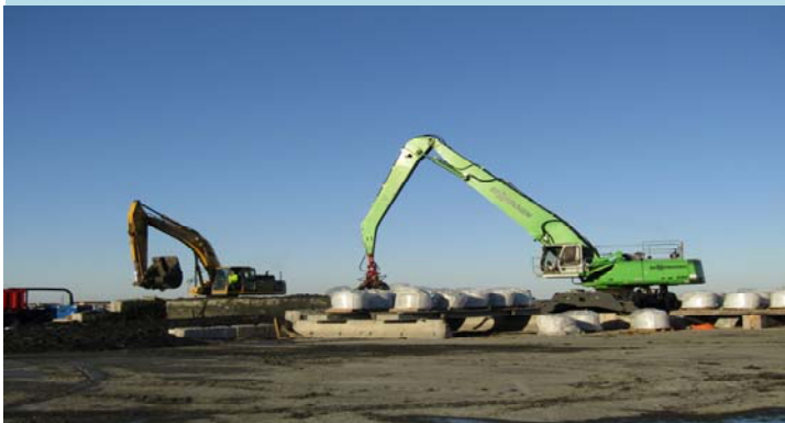
5 Adding portland cement to solidify dredge material