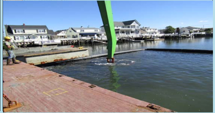
2 Removing material from the South Basin