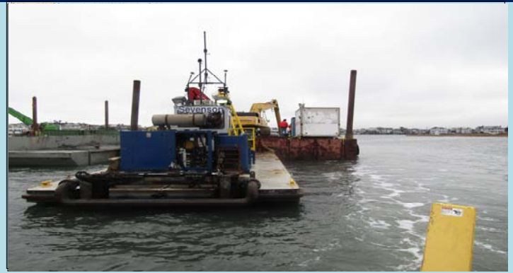
2 Tender boat assisting the PC-400 with a move