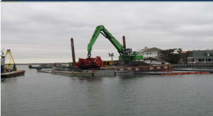
1 Sennebogen loading a scow in Pleasure Bay