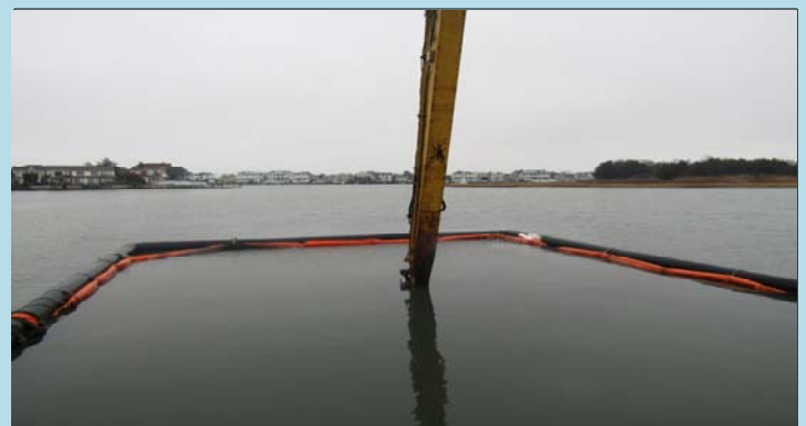
6 PC-400 dredging material inside of moon pool