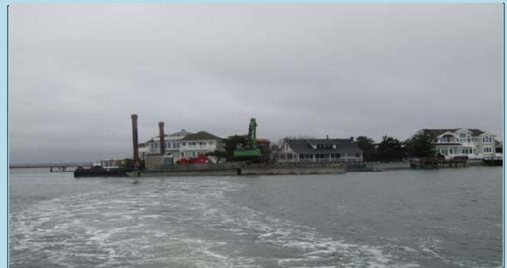
4 Sennebogen removing material in Pleasure Bay