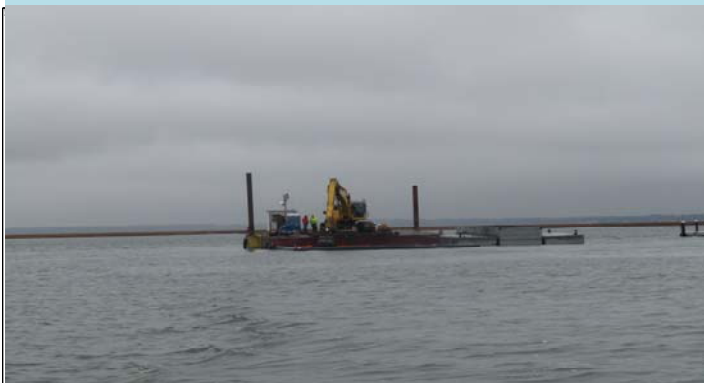
3 PC-400 longfront dredging in the Access Channel