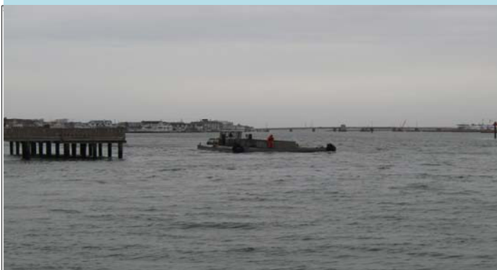
5 Tug boat pushing a scow full of dredge material