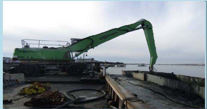
4 Sennebogen unloading a scow at the bulkhead