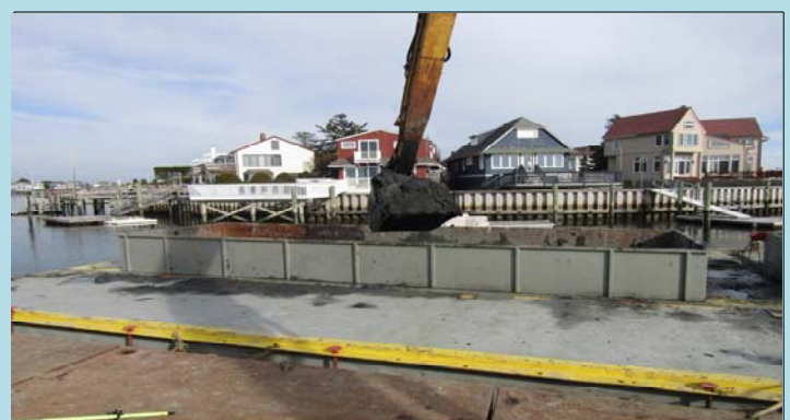
6 PC-400 loading a scow with sandy material in the Access Channel