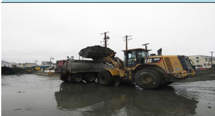
3 Cat 966 Loader disposing of ammended dredge material