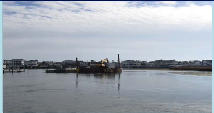
2 PC-400 Longfront dredging at the East end of the Access Channel