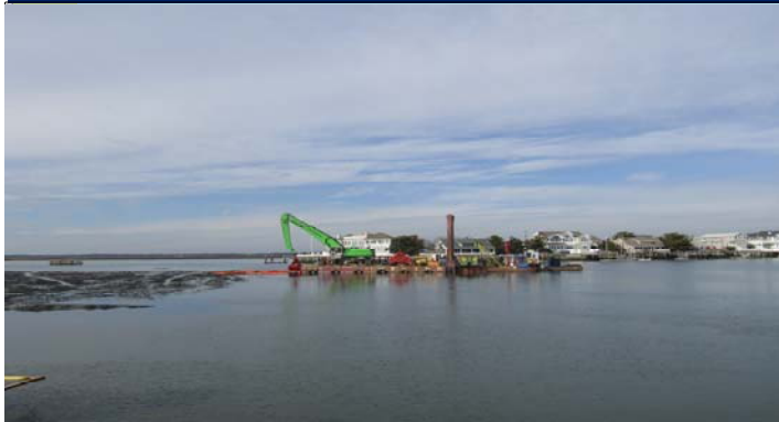
1 Sennebogen dredging in the Access Channel