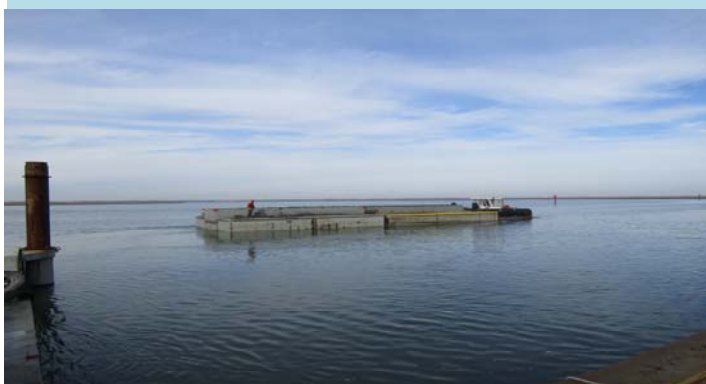
5 Tug boat leaving 81st street with an empty scow