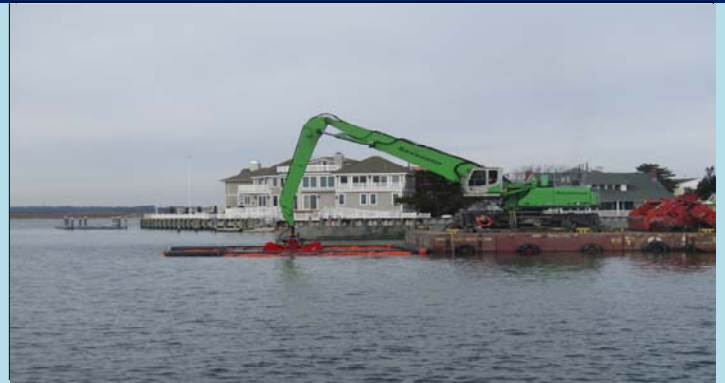
2 Sennebogen dredging hard sandy material in the Access Channel