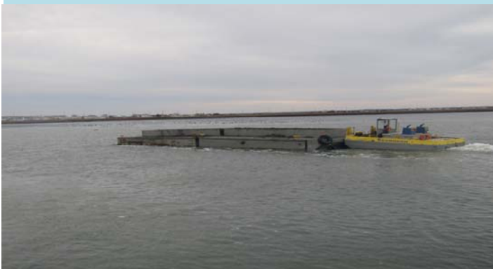
5 Pushing an empty scow to the Access Channel