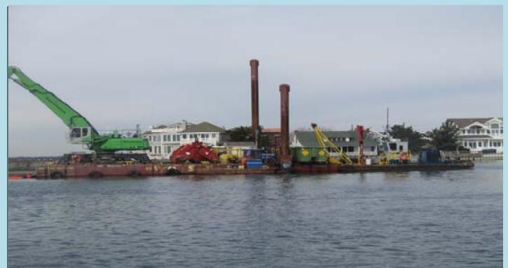
6 Tender boat assisting the Sennebogen barge in a move