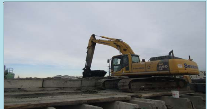
4 PC-350 mixing dredge material with Portland cement