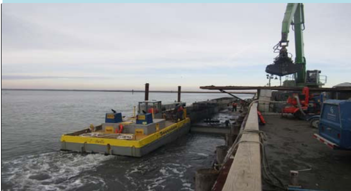
3 Tug Boat landing a scow to be unloaded at the bulkhead