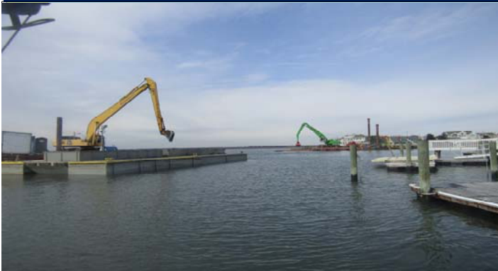
1 Both machines dredging in the Access Channel