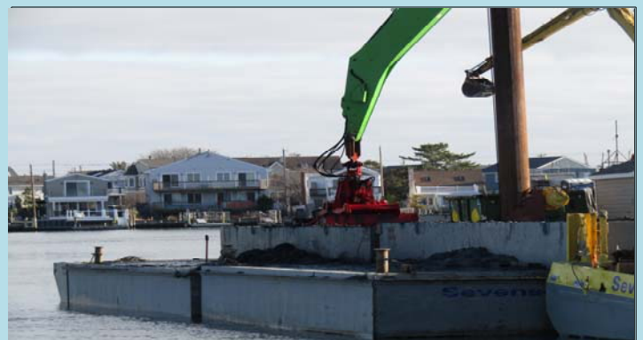
6 Sennebogen loading a scow with dredge material