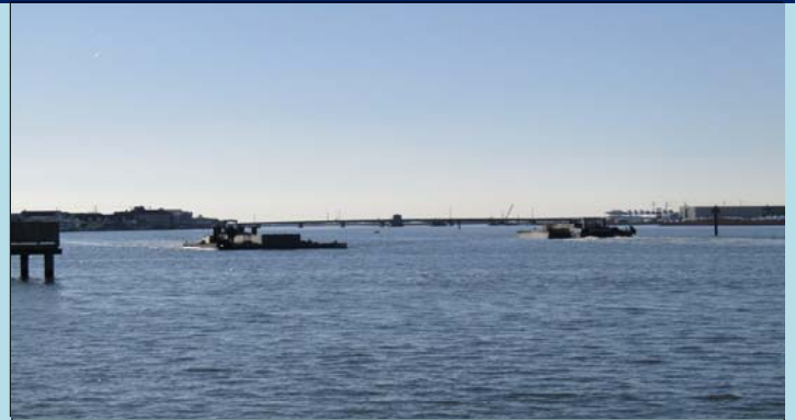
2 Scows being transported to and from the Access Channel