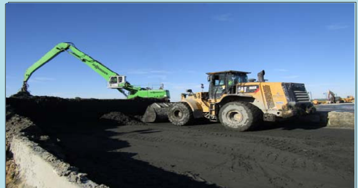
4 Moving ammended dredge material from the mixing cell