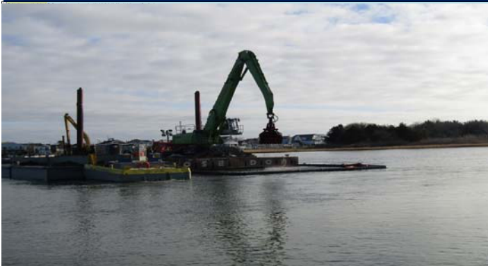
1 Sennebogen dredging in Pleasure Bay