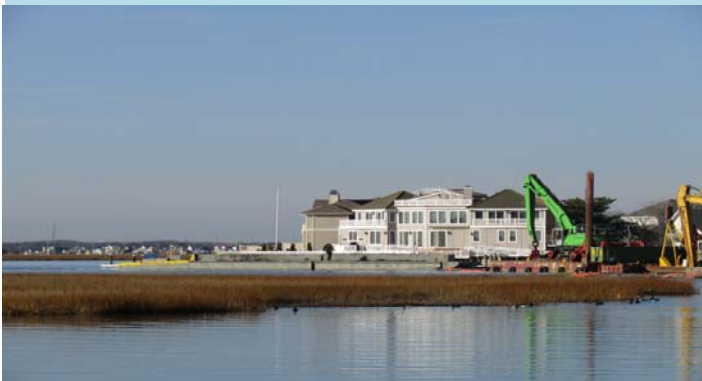
3 Landing an empty scow at the Sennebogen Barge