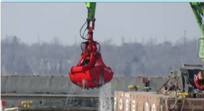
5 Sennebogen draining excess water in the Access Channel