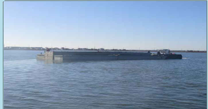
4 Tug boat pushing an empty scow to the Access Channel