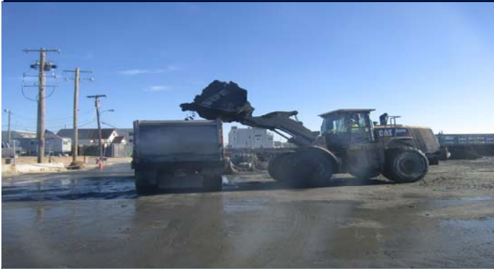
1 Loading a truck with ammended dredge material