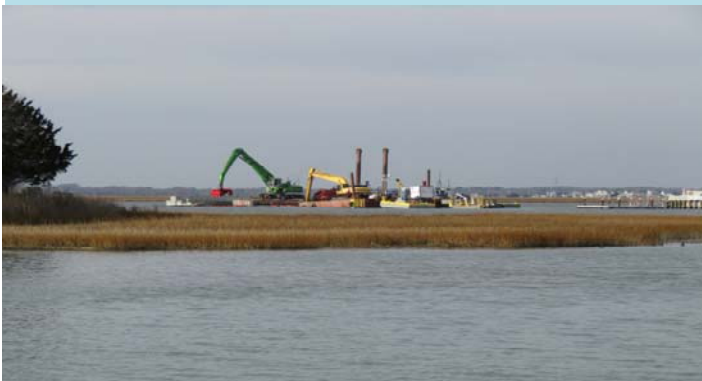
3 Both machines performing touch up work in the Access Channel