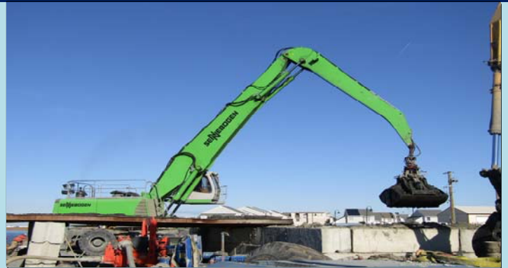
2 Sennebogen mixing dredge material with Portland cement