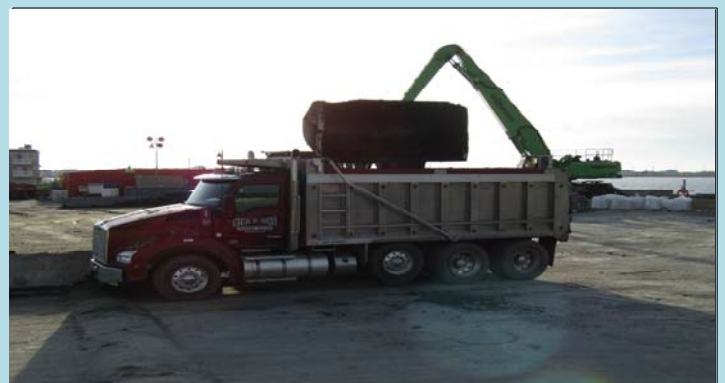
6 Loading a truck to be hauled to Cape Mining Landfill