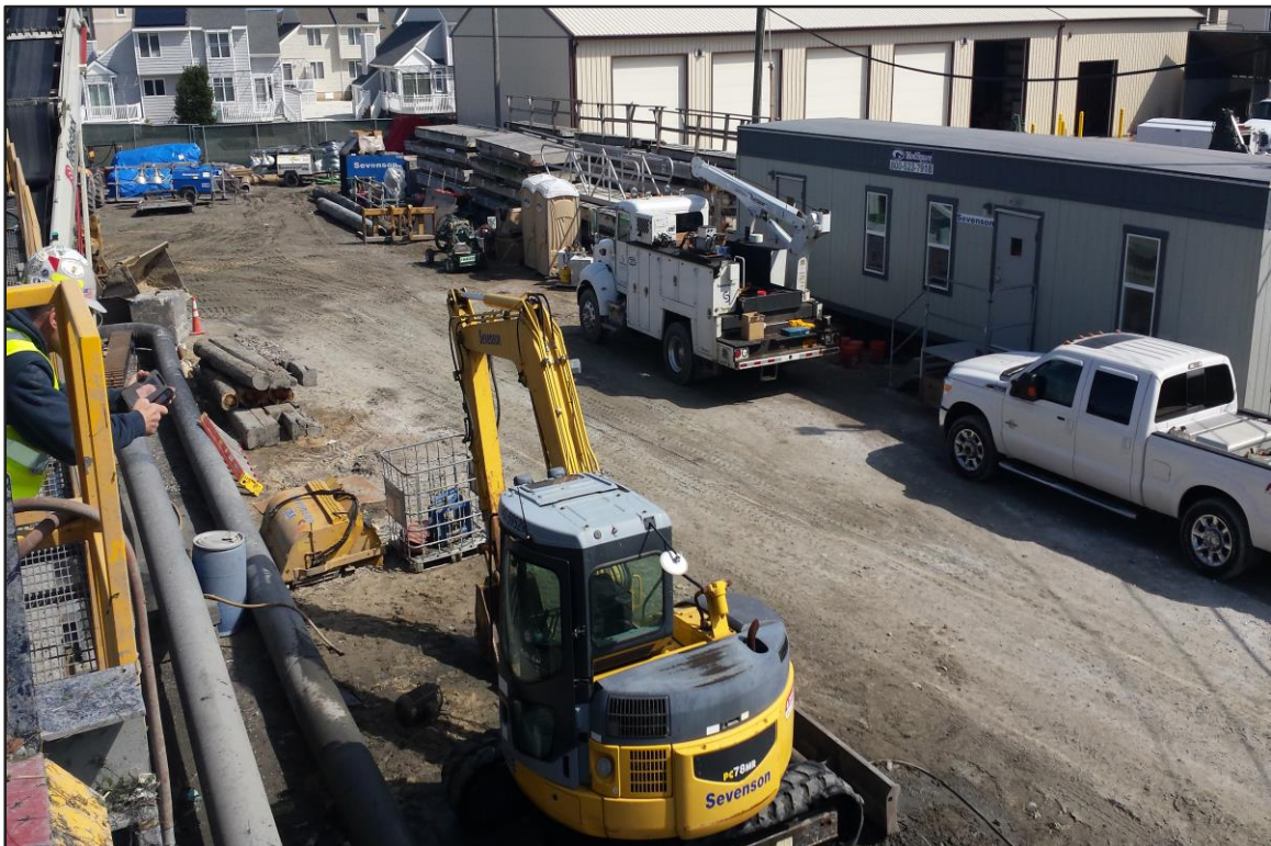
Photograph 8: De-Watering Area – Elevated parking area, equipment on standby. (Looking northeast)