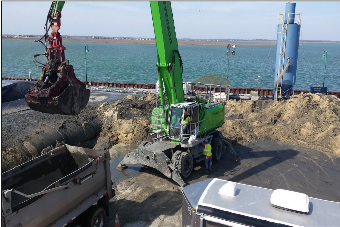
Photograph 11: De-Watering Area – Material disposal in progress. (Looking west)