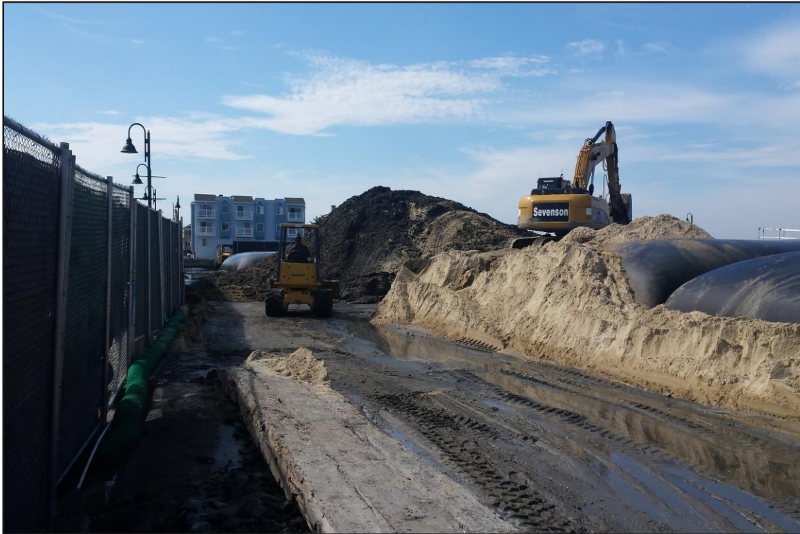
Photograph 7: De-Watering Area – Sand blending in progress. (Looking south)