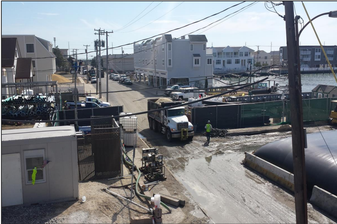
Photograph 9: Site Entrance. (Looking east)