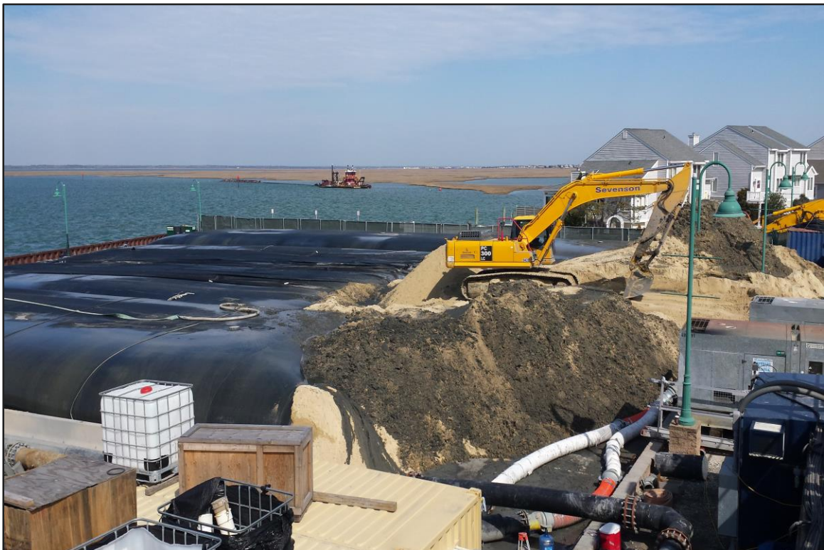
Photograph 12: De-Watering Area – Sand blending in progress. (Looking north)