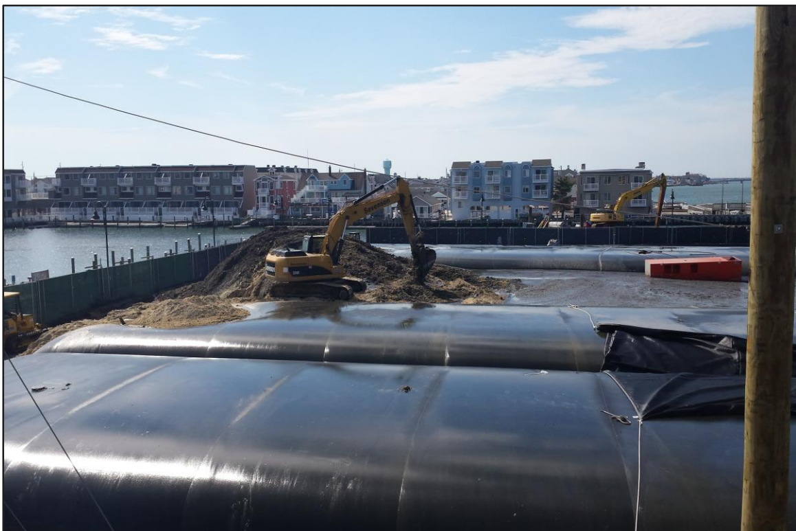
Photograph 10: De-watering Area – Sand blending in progress. (Looking south)