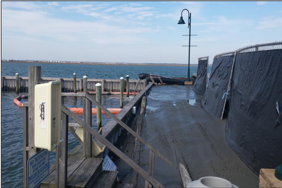
Photograph 5: De-watering Area/North Basin – Dredged material, discharge pipes. (Looking west)