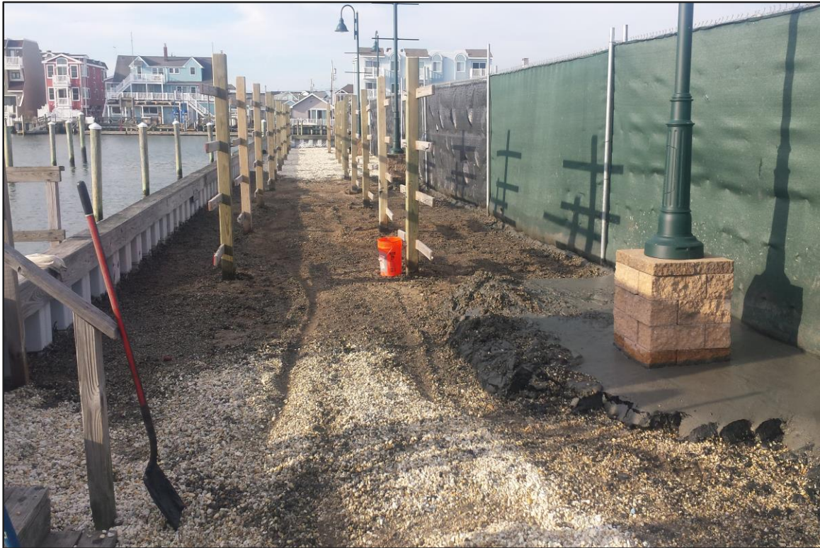
Photograph 1: De-Watering Area – Cleanup of dredge slurry. (Looking south)