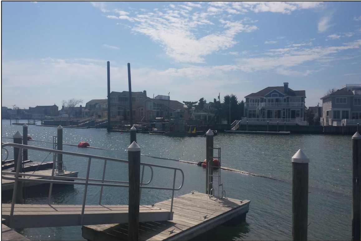
Photograph 3: Shelter Haven – Hydraulic dredge on standby. (Looking southeast)