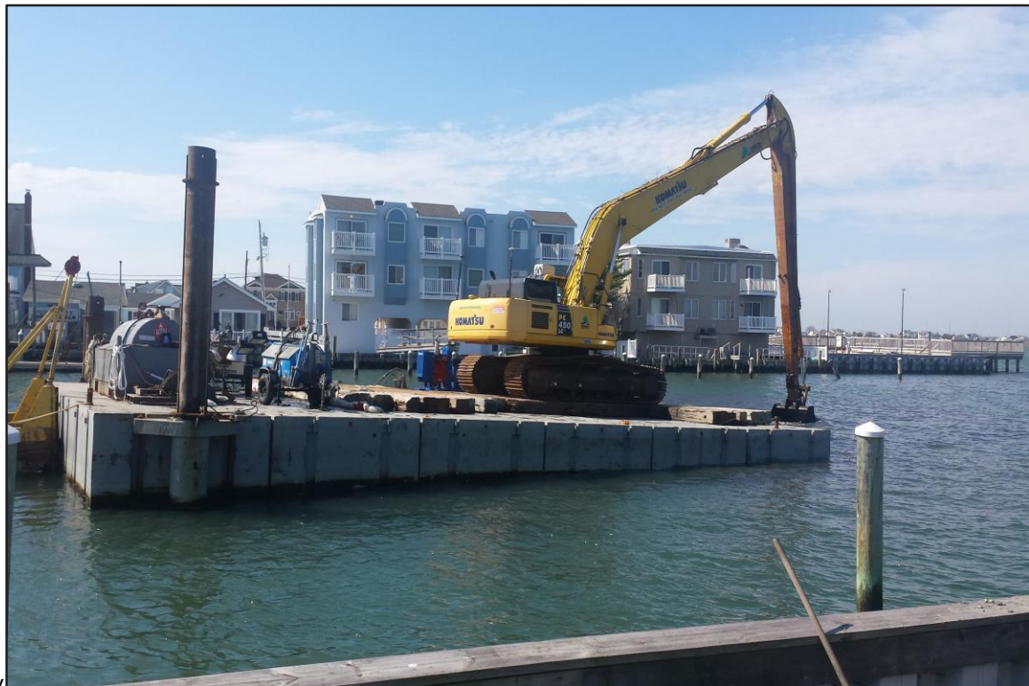
Photograph 2: North Basin – Mechanical dredging in progress. (Looking south)