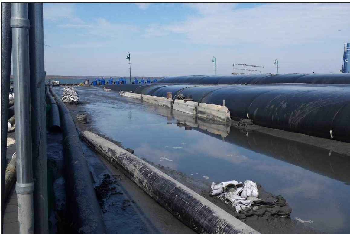
Photograph 4: De-Watering Area – Dredged material from geobag failure. (Looking west)