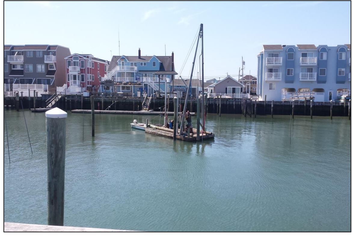
Photograph 8: North Basin - Marina pile replacement in progress. (Looking south)