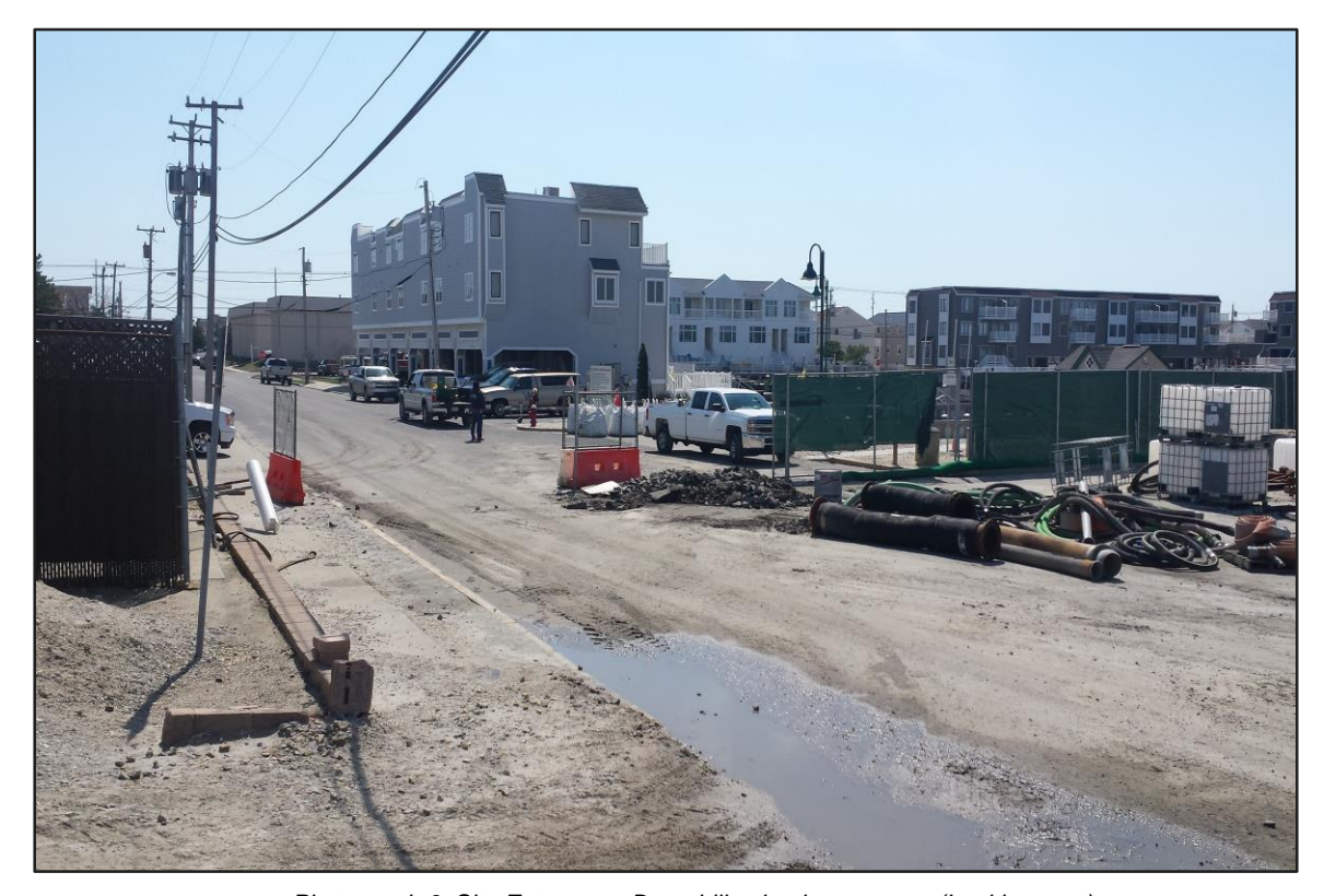
Photograph 6: Site Entrance - Demobilization in progress. (Looking east)