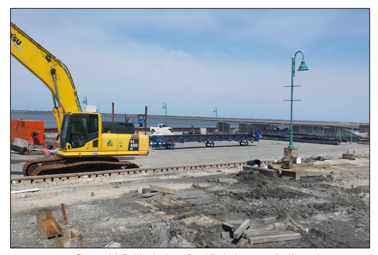
Photograph 2: De-Watering Area – Demobilization in progress. (Looking west)