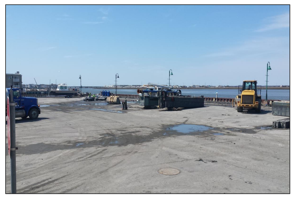
Photograph 4: De-Watering Area – Demobilization in progress. (Looking southwest)