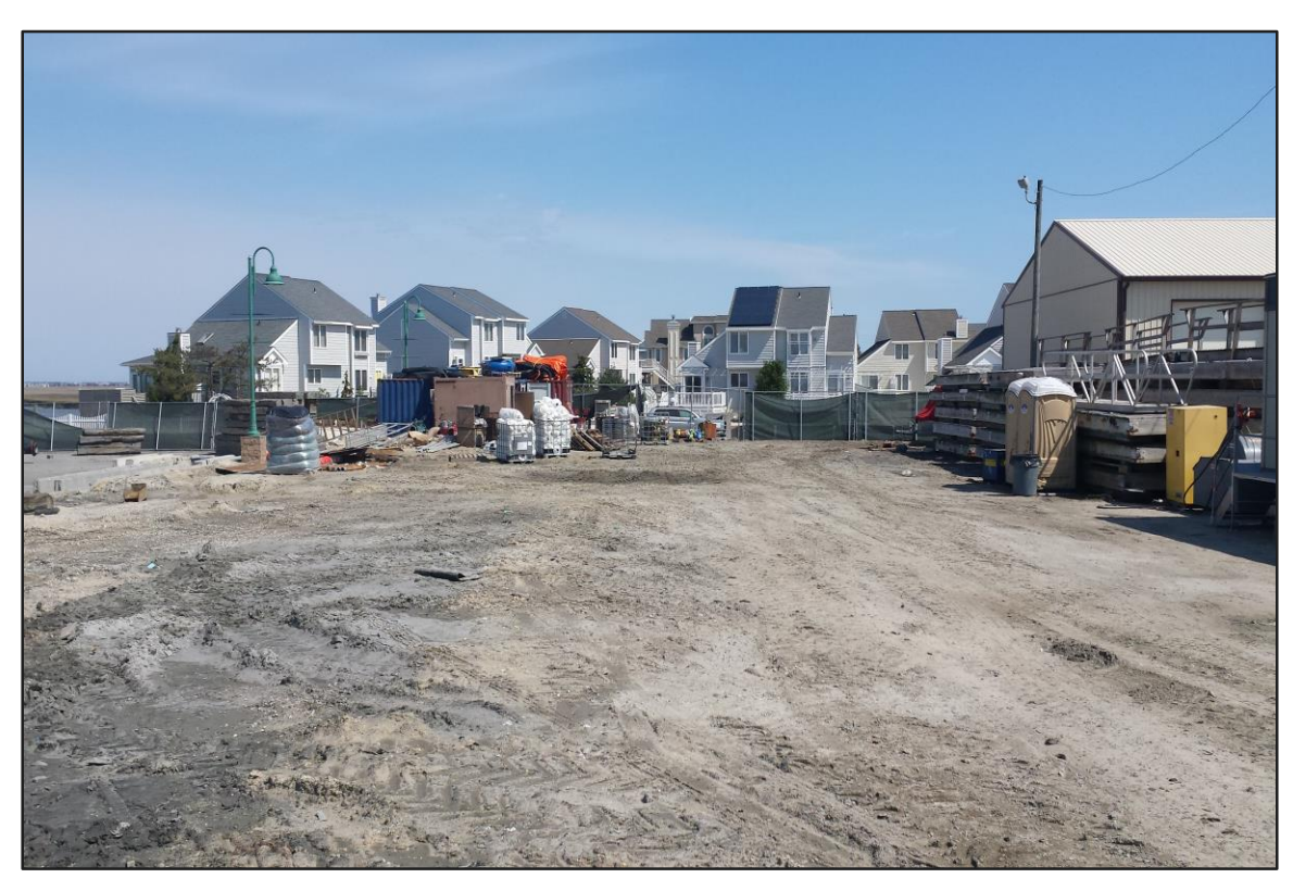
Photograph 1: De-Watering Area – Demobilization in progress. (Looking north)