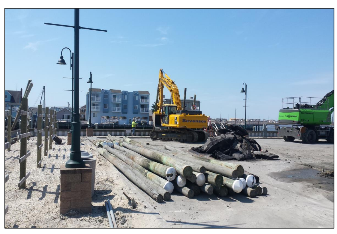
Photograph 7: De-Watering Area – Marina pile replacement in progress. (Looking south)