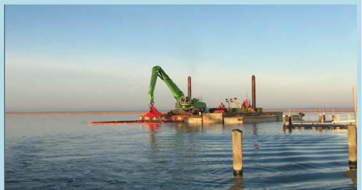
6 Dredging operations in the Access Channel