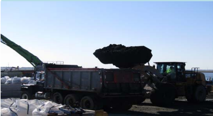
3 Loading a truck to be hauled to Cape Mining Landfill