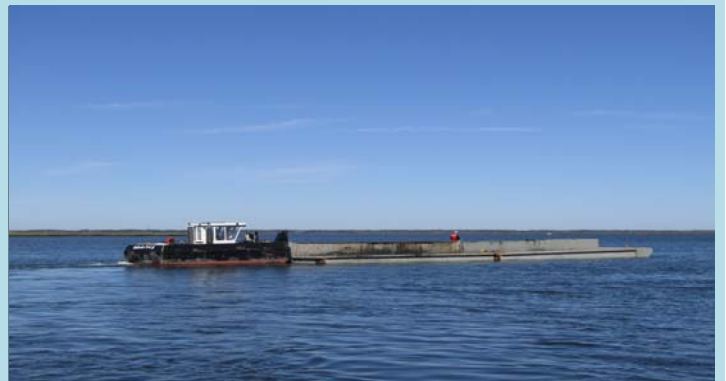
4 Full scow being transported to 81st street for unloading