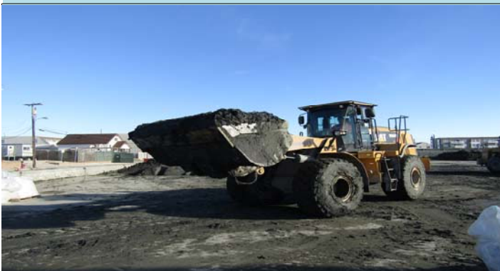
5 Moving amended dredge material on the pad