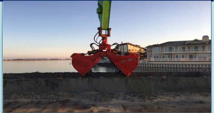
2 Loading a scow with sandy material