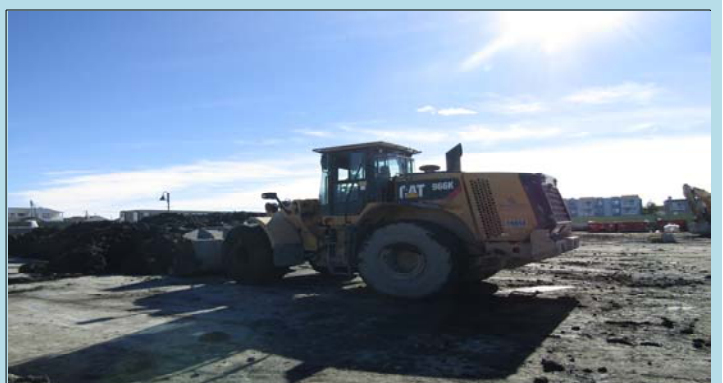
4 Loading out dredge material to the material staging area