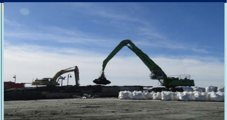
2 Ammending dredge material with portland cement