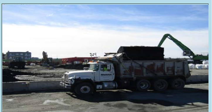
6 Loading out ammented dredge material for disposal