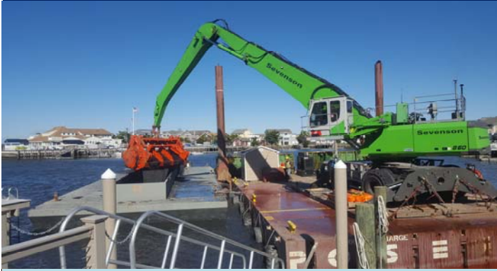
1 Performing residential dredging in Snug Harbor