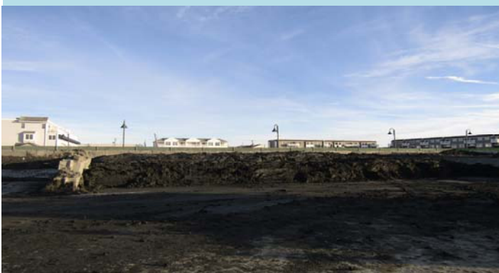
5 Staged ammented dredge material prepped for loadout