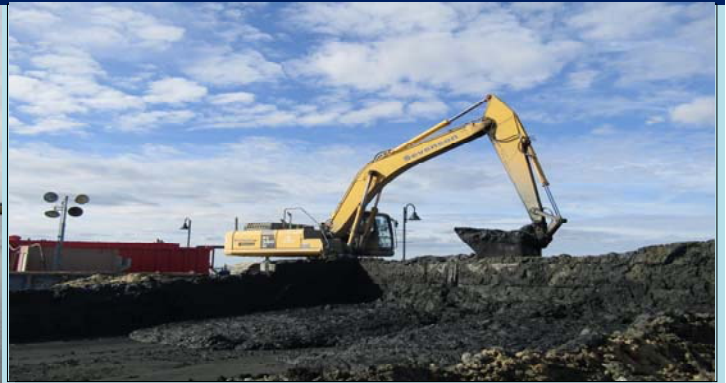
2 PC - 350 Excavator amending dredge material with Portland cement