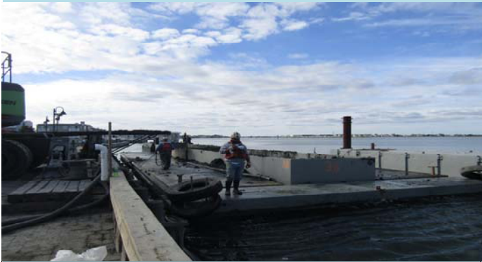
3 Full scow arriving at the bulkhead for unloading