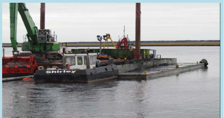
6 Full scow departing dredge barge for 81st street