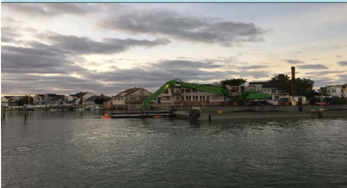
5 Dredging Stone Harbor Basin from Inner Coastal