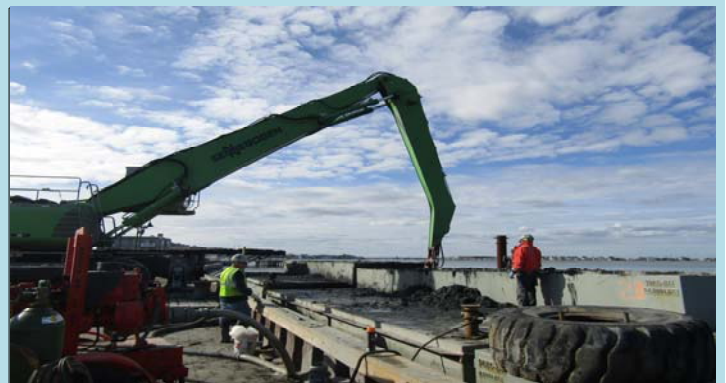
4 Unloading dredge material to be mixed with Portland cement