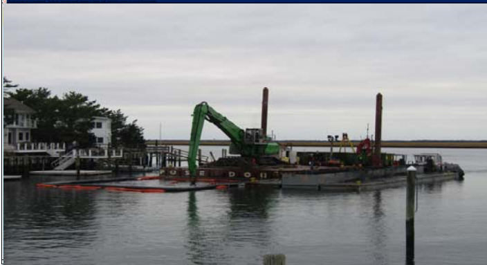
1 Dredging activities in Stone Harbor Basin