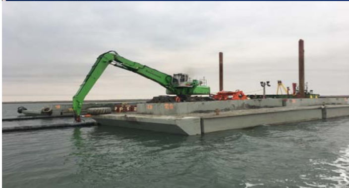
1 Dredging in the Access Channel