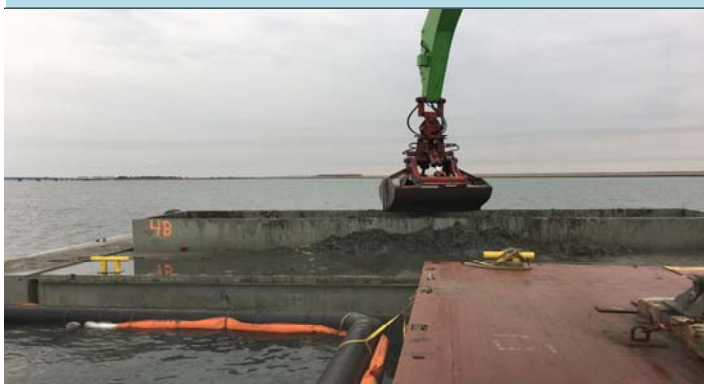
5 Loading a scow in the Access Channel