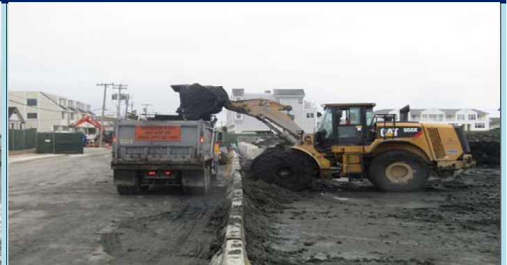
2 Loading out amended dredge material for disposal