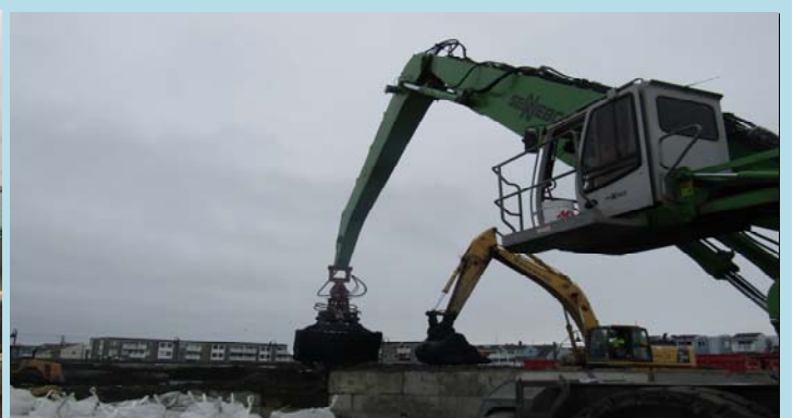
6 Sandy material not needing to be mixed with Portland cement