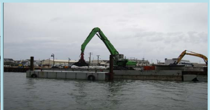
4 Sennebogen unloading a scow with dredge material