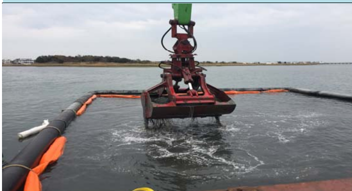
3 3.5 CY clamshell with a full bucket in the Access Channel