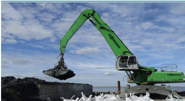
3 Sennebogen unloading dredge material