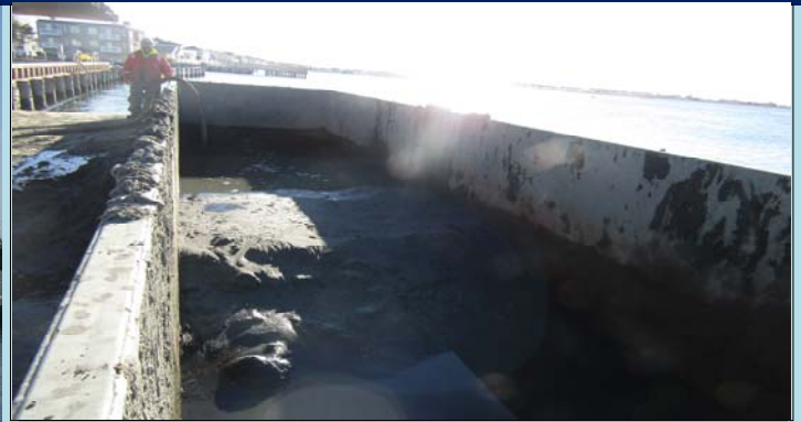
2 Sandy material from the Access Channel being prepared to be unloaded at the bulkhead