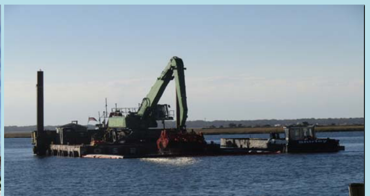
4 Dredging activities in the Access Channel