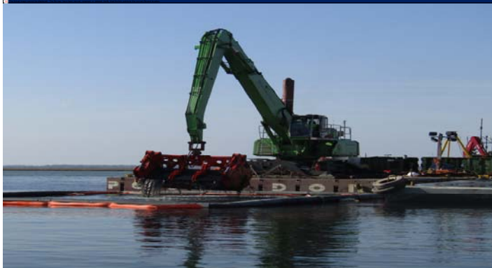
1 Dredging in the Access Channel