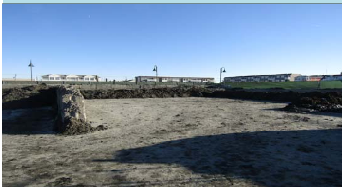
5 Clearing room in staging cell 1 for dredge material