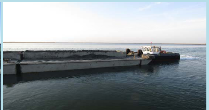
6 Tug boat pushing an empty scow to the dredge barge