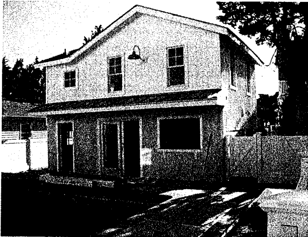
FRONT, RIGHT SIDE VIEW 11/3/11

If submitting more photographs than will fit on the preceding page, affix the additional photographs below. Identify all photographs with: date taken; "Front View" and "Rear View"; and, if required, "Right Side View" and "Left Side View."