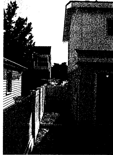
LEFT SIDE VIEW 11/3/11