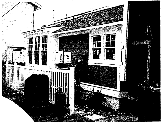
LEFT SIDE VIEW 12/11/07