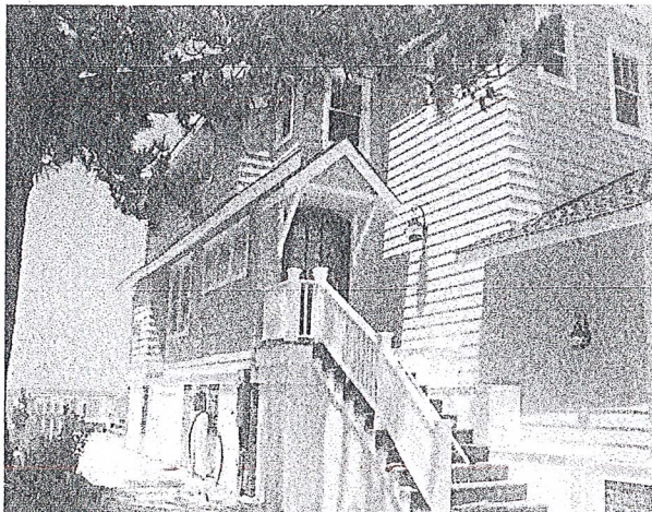
SOUTH SIDE 6/4/2014