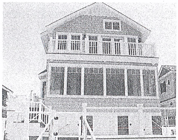
REAR VIEW 6/4/2014