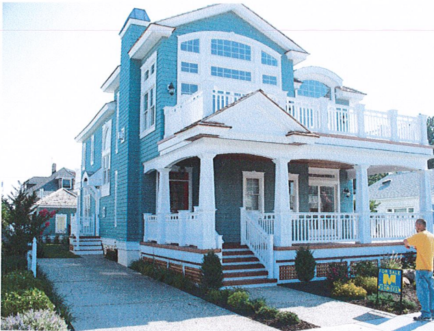
FRONT, LEFT SIDE VIEW 8/19/08

If submitting more photographs than will fit on the preceding page, affix the additional photographs below. Identify all photographs with: date taken; "Front View" and "Rear View"; and, if required, "Right Side View" and "Left Side View."