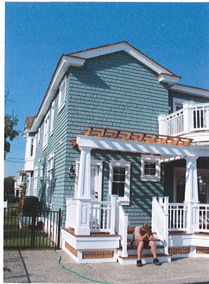
REAR, RIGHT SIDE VIEW 8/19/08