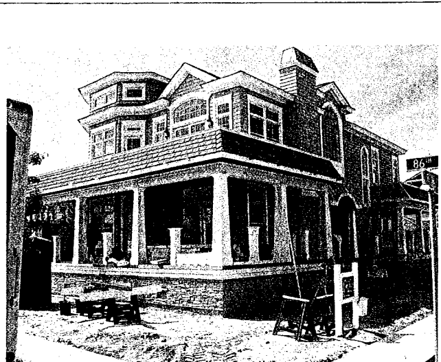
FRONT, LEFT SIDE VIEW 6/3/08