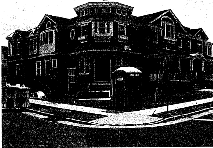
DATE: June 29, 2011, Front View of Residence

If using the Elevation Certificate to obtain NFIP flood insurance, affix at least two building photographs below according to the instructions for Item A6. Identify all photographs with: date taken; "Front View" and "Rear View"; and if required, "Right Side View" and "Left Side View". If submitting more photographs than will fit on this page, use the Continuation Page, following.