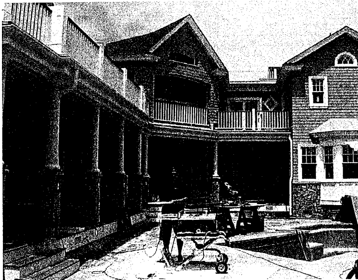
DATE: June 29, 2011, Rear View of Residence