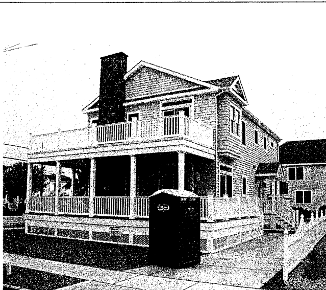
REAR, RIGHT SIDE VIEW 4/21/09

If using the Elevation Certificate to obtain NFIP flood insurance, affix at least two building photographs below according to the instructions for Item A6. Identify all photographs with: date taken; "Front View" and "Rear View"; and, if required, "Right Side View" and "Left Side View." If submitting more photographs than will fit on this page, use the Continuation Page, following.