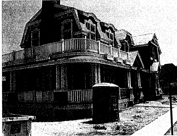
DATE: July 5, 2011, Front View of Residence

If using the Elevation Certificate to obtain NFIP flood insurance, affix at least two building photographs below according to the instructions for Item A6. Identify all photographs with: date taken; "Front View" and "Rear View"; and if required, "Right Side View" and "Left Side View". If submitting more photographs than will fit on this page, use the Continuation Page, following.